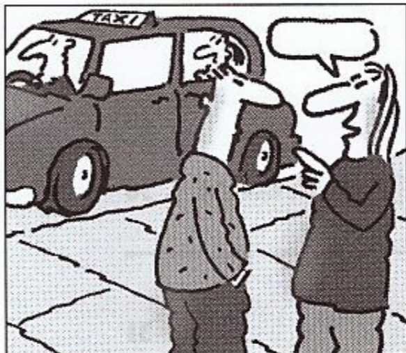
5 _____ in a taxi.