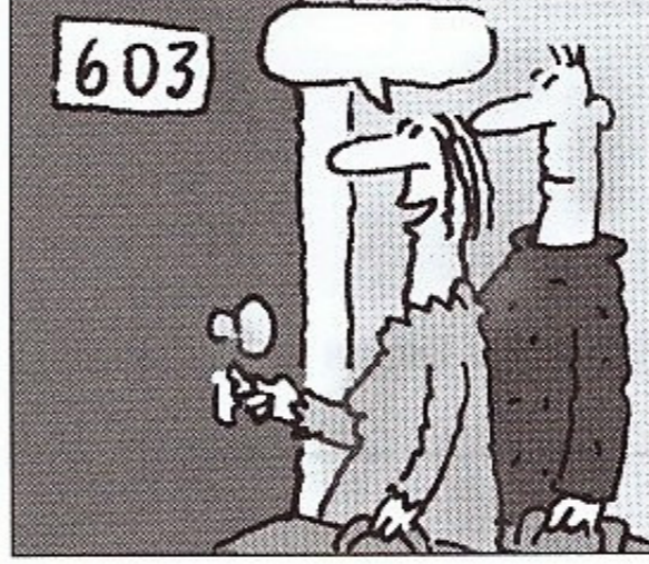
7 _____ in room 603.