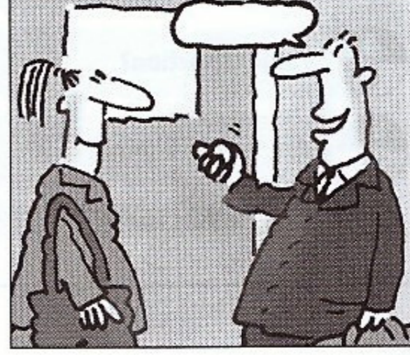
8 Hello. _____ in my class.