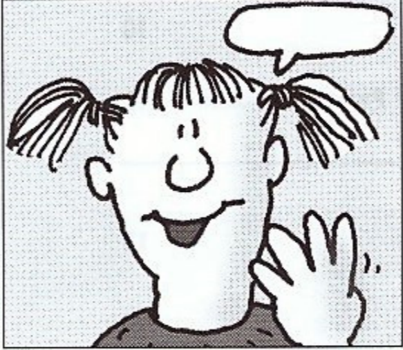
1 I'm 4.