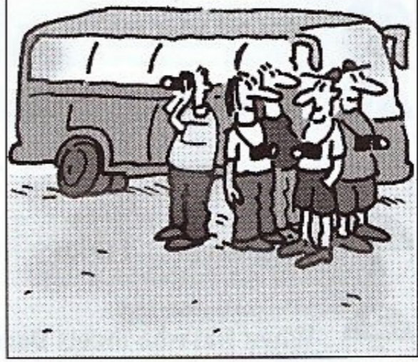
2 _____ tourists.