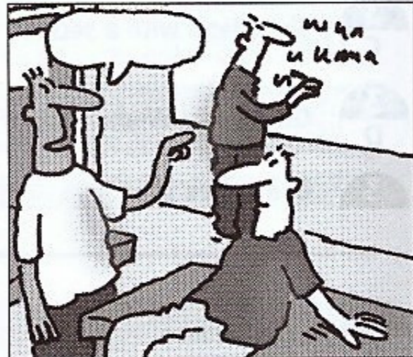
6 _____ a teacher.